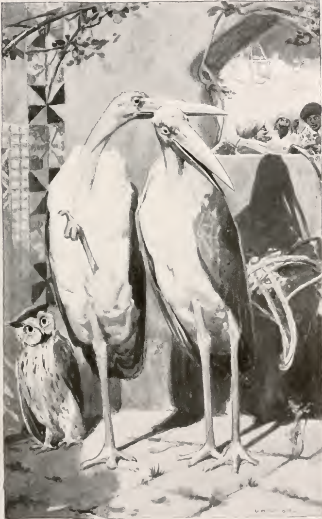
THE ALIPH STORK

The owl carried the to the stork's nest the (1925)